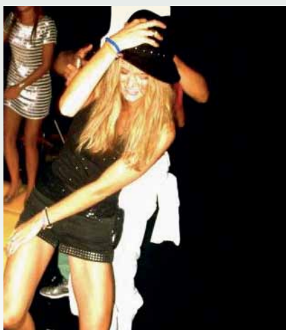
'I can do the moonwalk too'