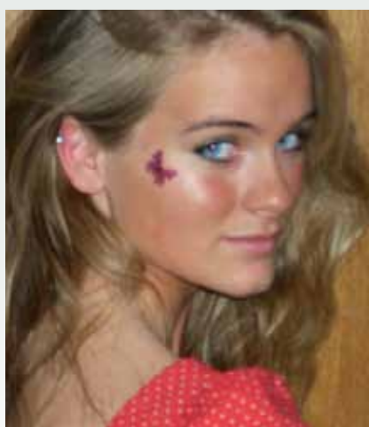
Fly, my pretty