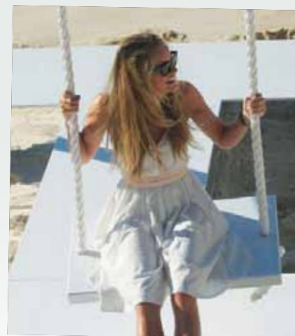
'Either I'm freakishly small or this swing is really big'