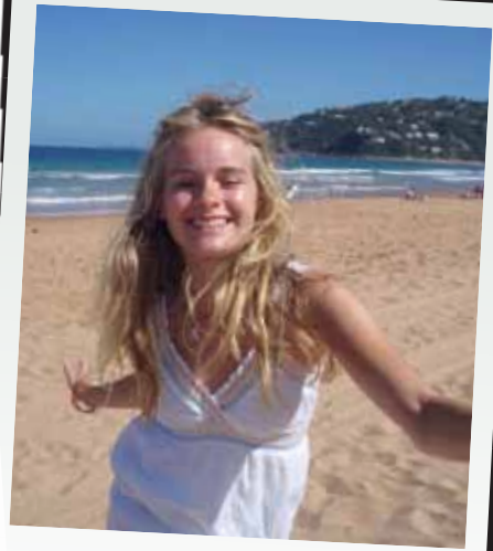
'I can do interpretive dance anywhere'