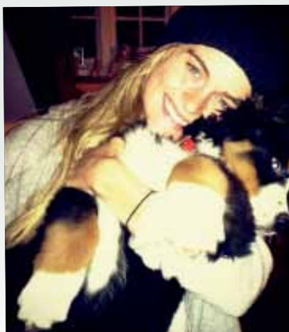
Posh girls believe in dog