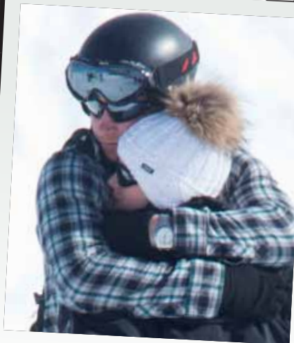
With Prince Harry on the slopes of Verbier