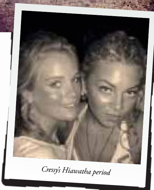
Cressy's Hiawatha period

15 She's into folksy bands like Passenger and Mumford and Sons. And her half-sister Gabriella is expecting a baby with her fiancé, husky singer-songwriter Alan Pownall, so there is a whole homespun guitar thing going on.